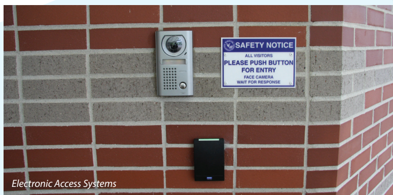
Electronic Access Systems