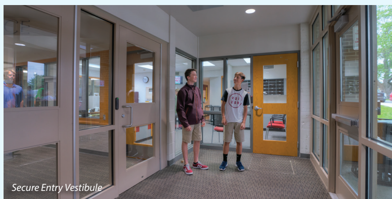
Secure Entry Vestibule